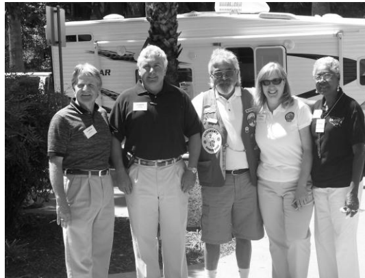
2006 RV Day at the Capitol participants